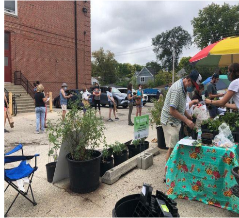
Rusty Patched Bumblebee Plant Giveaway.