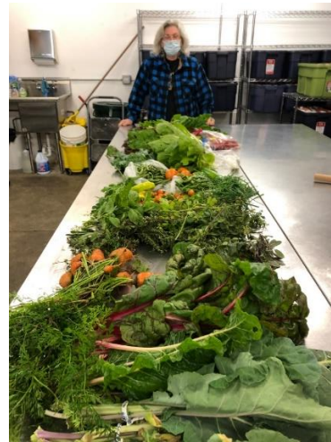
Produce sharing had a banner year.