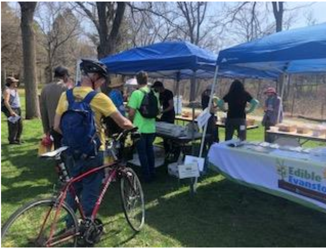
Seed swap at Earth Day celebration.

They also initiated a new “New Gardener Program” during the year.