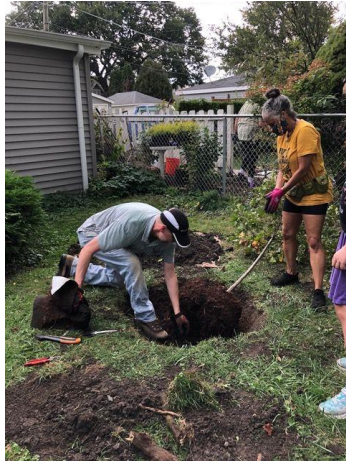
Planting in the 5 th Ward.