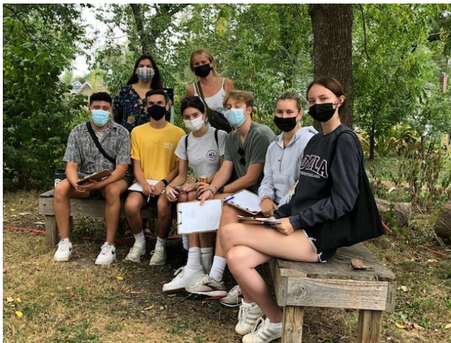
Classes were held at the Food Forest.